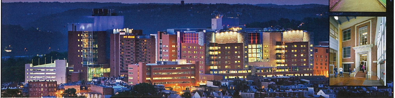
PJ Dick Projects: (above) Children’s Hospital of Pittsburgh of UPMC ; (top to bottom) Carnegie Mellon University Gates Center for Computer Science and Penn State Shenango Sharon and Lecture Halls